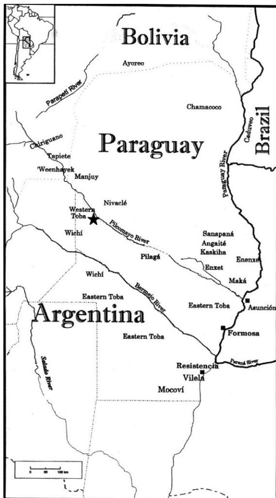
Fig. 1. Approximate location (indicated with black solid star), within the Gran Chaco of South America, of the Toba and Wichí communities in this study. Modified, with permission, from Miller (1999).

However, major changes in their traditional lifestyle have occurred since the arrival of European settlers in the late 1800s. The restrictions on access to large tracts of land, their partial integration into the labor market, and the arrival of missionaries from various Christian groups have determined the settlement process of these communities (Braunstein and Miller, 1999; Gordillo, 1994, 2002; Mendoza, 2002; Mendoza and Wright, 1989). As a result, Toba and Wichí settlements vary over an array of environments and show considerable variation in lifestyles. These range from a rural, traditional lifestyle that is quite dependent on hunting and gathering, to an urban, sedentary lifestyle that depends on wage labor and store-bought goods for sustenance. The lifestyle changes more relevant to our analyses began between 50 and 100 years ago.